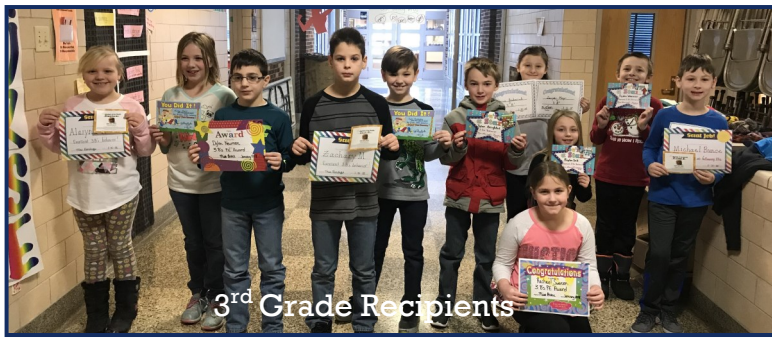
3 rd Grade Recipients