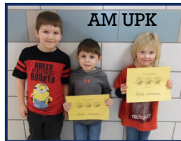
1 st Grade