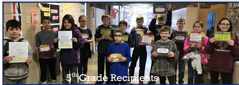
5 th Grade Recipients