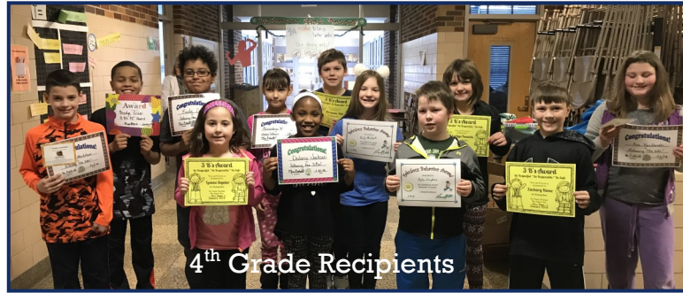
4 th Grade Recipients